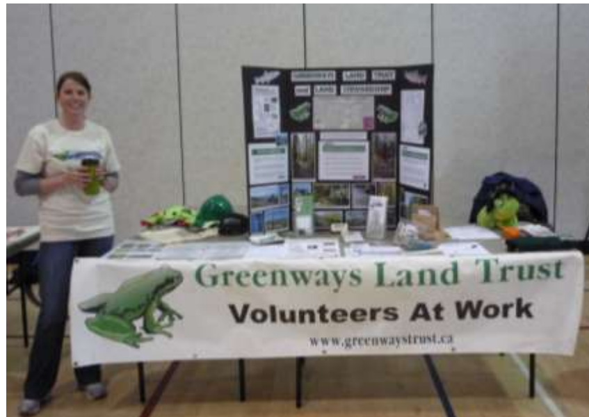
GLT Outreach Events

This report describes the profile of the organization during this time, and summarizes the projects and activities completed. Further information is always available from our office.