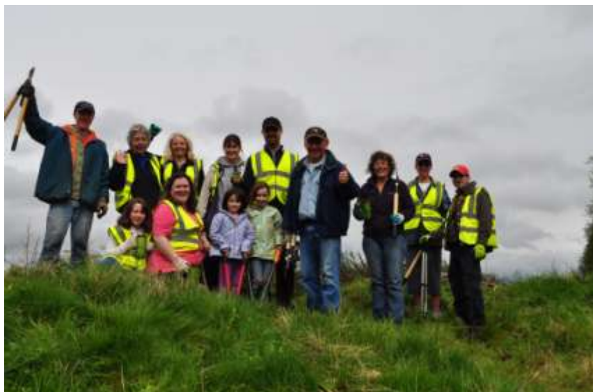
2010 Broom Bash volunteers