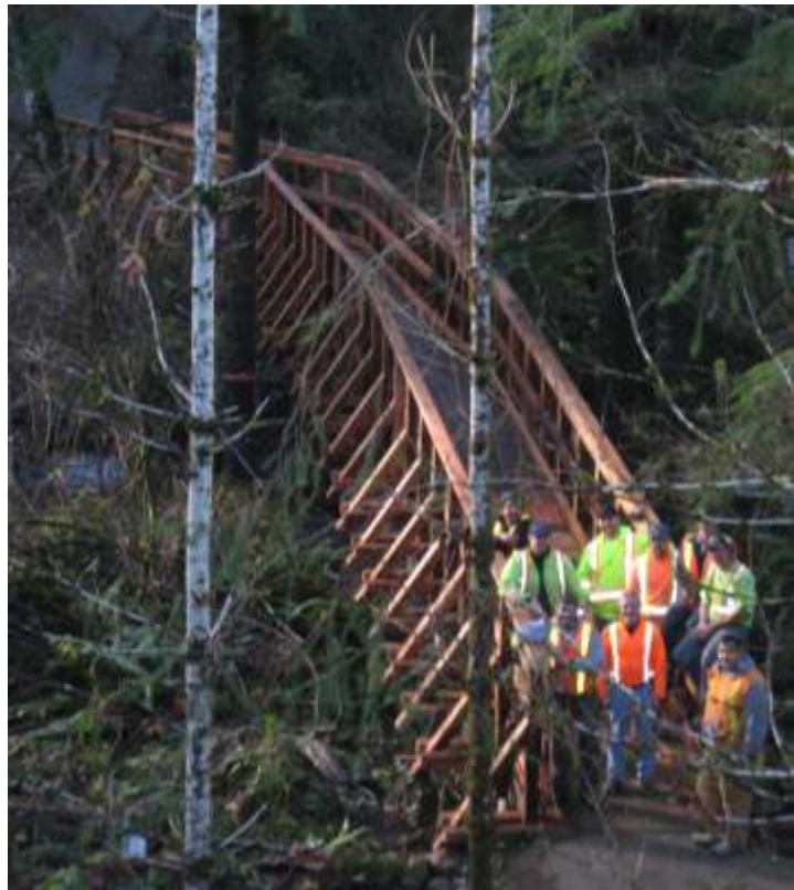
Construction Crew Greenways Loop – Jubilee Connector Willow Creek Bridge, finished product