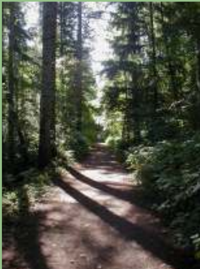
Beaver Lodge Forest Lands

The Discovery Coast has a remarkable variety of ecologically sensitive areas, preserved lands, seascapes, streams and river corridors. The Oyster and the Campbell Rivers provide ecological anchors to the area along with other vital streams.